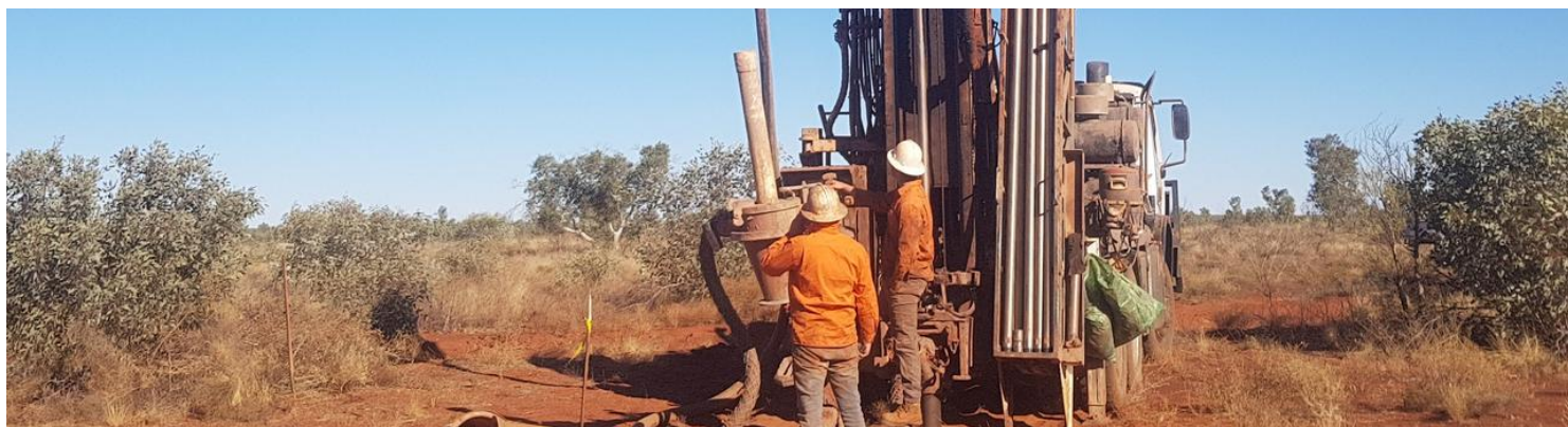
The Prodigy Gold Tanami aerial survey is currently underway.

“The national drilling initiative also drilled a single 1750m deep hole, called NDI Carrara 1, near the Northern Territory/Queensland border. The aim of this project was to promote future energy and mineral exploration and discovery in the South Nicholson Basin region.