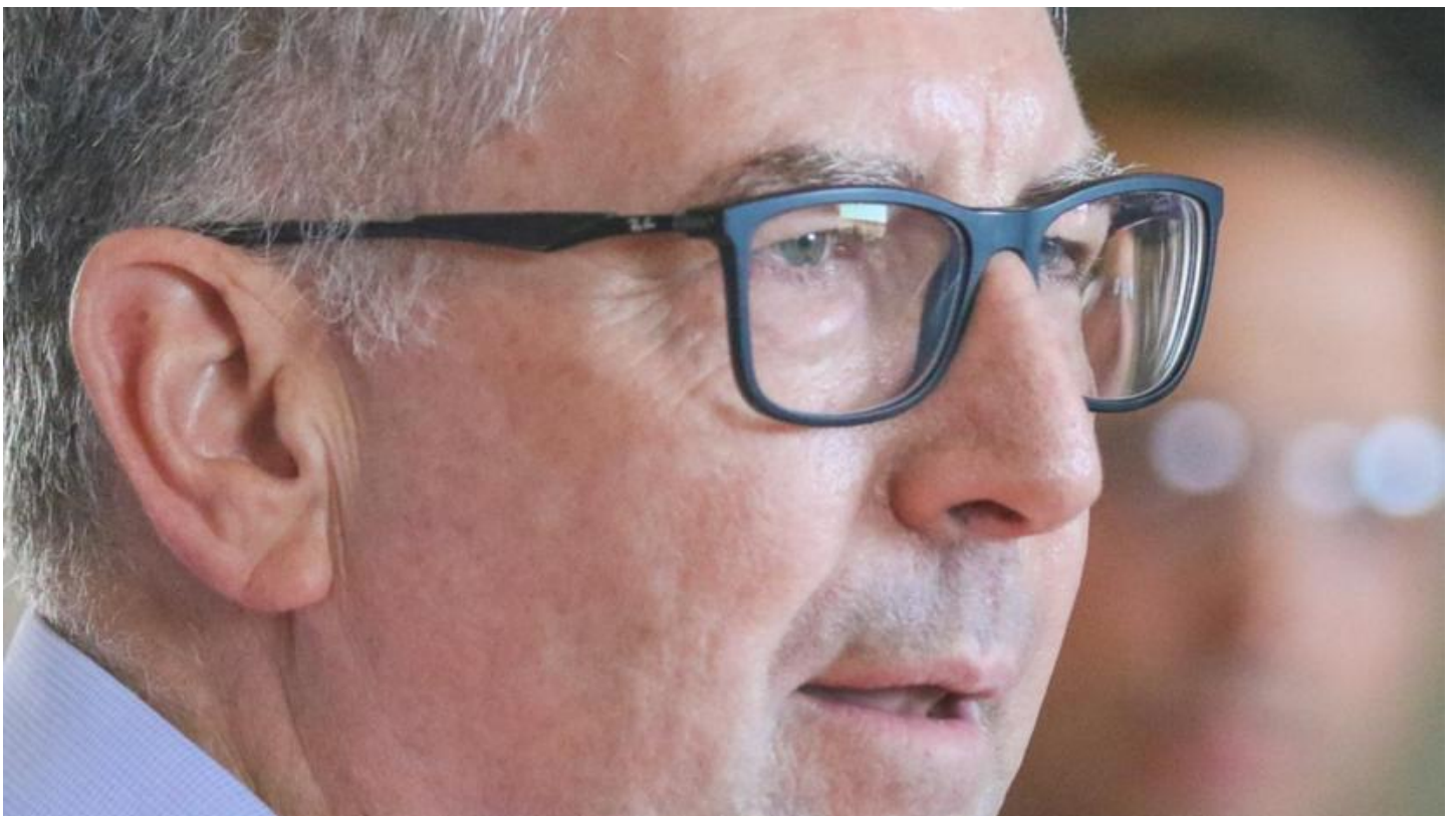
Resources Minister Keith Pitt as Santos makes a project announcement at Kaefer's East Arm Plant